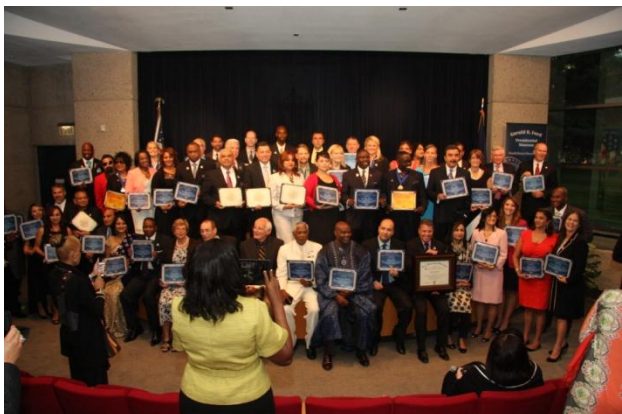
August 22, 2014

Gerald R. Ford Presidential Museum 303 Pearl St NW Grand Rapids, MI 49504