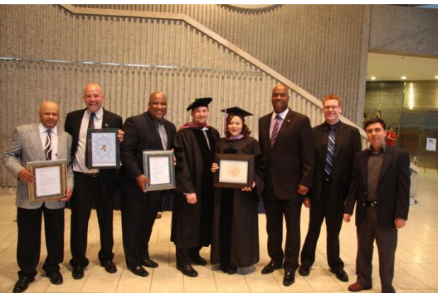
May 31, 2013